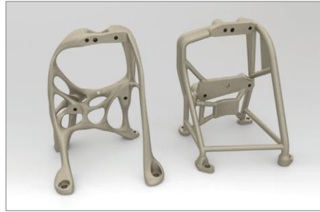
Optimized and 3D printed metal aerospace bracket