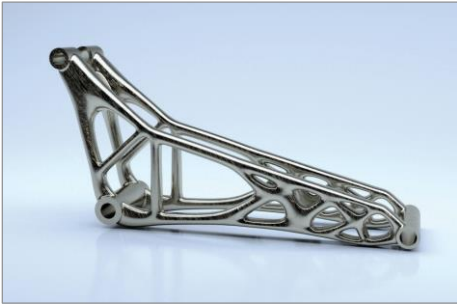
Optimal concept for a 3D printed bike rocker arm